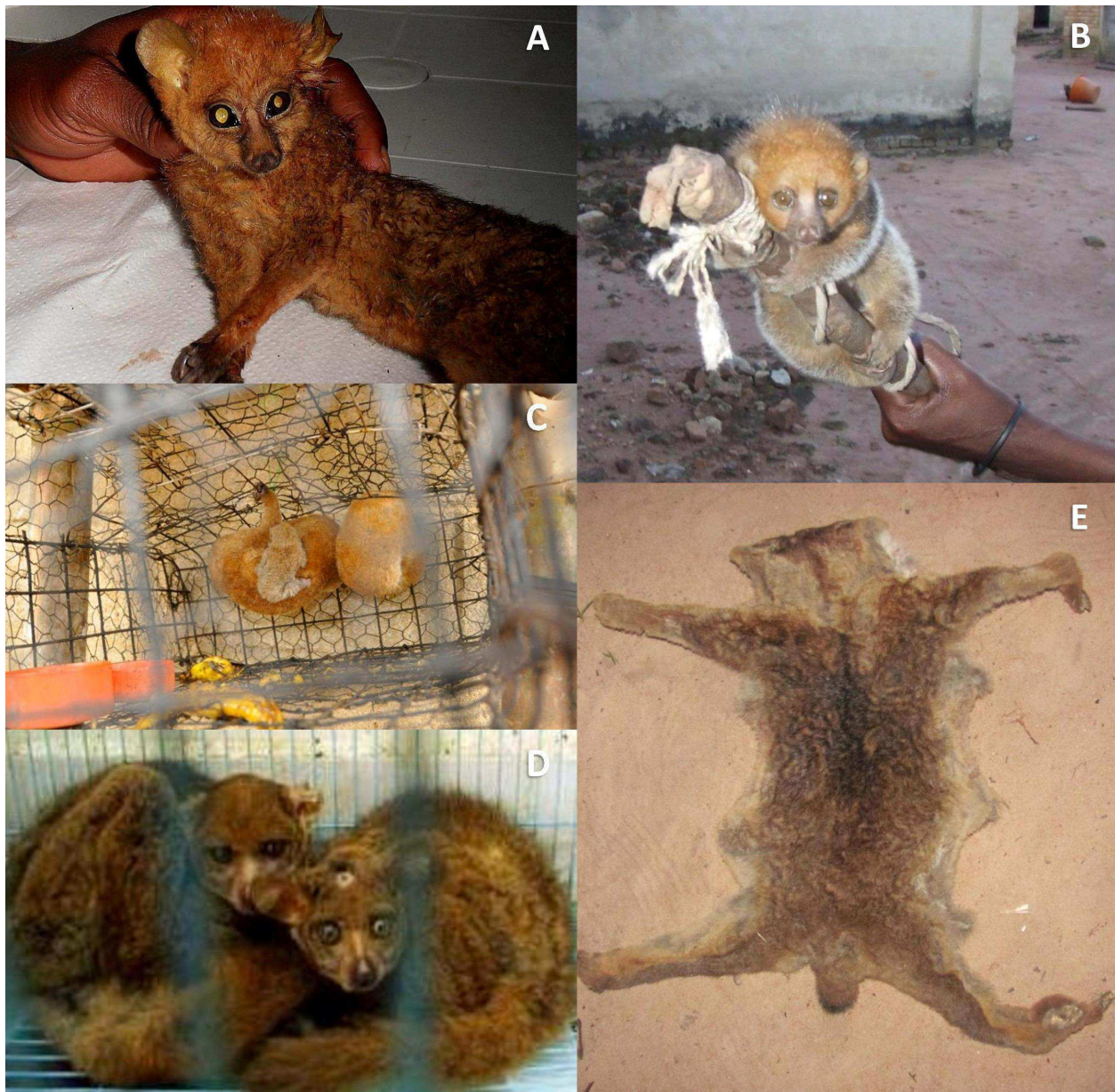
Figure 3 – (A) Arctocebus aureus hunted for bushmeat in Republic of Congo in 2010. (B) Infant Perodicticus ibeanus in the pet trade in Northern DRC in 2008. (C) Family of A. calabarensis kept as pets in Cameroon in 2012. (D) Otolemur garnettii for sale as pets in United Arab Emirates in 2009. (E) Skin of P. ibeanus for sale in Lusambo area, DRC in 2014.

epilepsy (Zambia: Baskind and Birbeck, 2005). The traditional practices using African lorisiforms described in the literature and by the respondents refer mainly to current practices and beliefs.